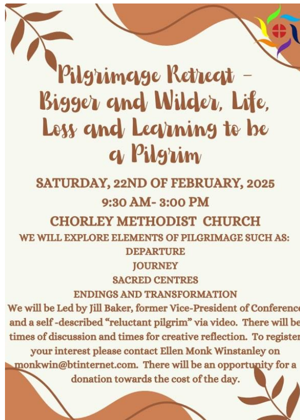
5 - Lancashire Pilgrimage Retreat