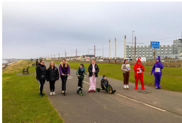
6 - All We Can-uary

hold onto a box of laminated carol sheets, but God is faithful and soon people began to join her. Here, she shares with us: "soon the voices of over 70 all age people, from toddler to granny, filled the sky with carols singing of the birth of our Lord Jesus Christ. The Christmas story was told in an interactive way and a prayer and a blessing shared. All stayed for fellowship for at least another hour after the service. This was my final Pioneer Carol Service here on Calderstones Park in the Clitheroe Circuit. When I came here 4 years ago, God put on my heart the word 'intentional'. I have done my upmost to be faithful to that call to share the Gospel with those who do not know him. There are no words that can adequately describe how humble I feel to have such a calling and the joy of seeing the Holy Spirit at work in the community here at Calderstones Park."