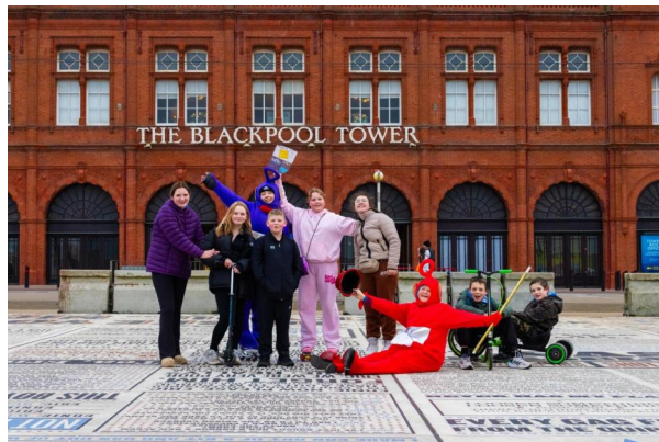
7 - All We Can-uary