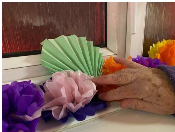
4 - Eco Church Offers Bereavement Support