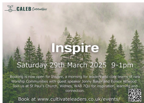
1 - Inspire

2) Film showing of The Silver Screen Dreams Cafe at Wythenshawe Methodist Church, Saturday 1 February 6.30pm - 9.30pm. The locally made feature film was shot at St Andrews Methodist Church cafe in Wythenshawe, and has given opportunities to Wythenshawe residents to be in front of and behind the camera and has been nominated at an International Film Festival. Come and watch the movie, find out how the actors got involved and how it's been a huge community affair! Find out more here .